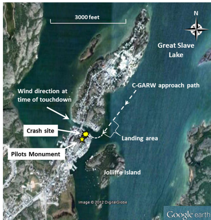
Figure 1. Yellowknife float-plane base

Due to the 2- to 3-foot waves (rollers) on the lake, the crew planned their approach so as to land close to the shore and to avoid entering the passage between the shore and Jolliffe Island (Figure 1). The captain also advised that the airspeed should be kept above 80 knots indicated airspeed (KIAS), which is 10 KIAS above the normal approach speed of 70 KIAS, for the full-flap (37.5°) approach and landing. During the approach, the captain cautioned the FO twice about the airspeed getting too low. The aircraft touched down in the intended landing area and bounced, then contacted the water a second time with the right float first. The float dug in, and the aircraft yawed to the right, turning towards the shore. The stall warning sounded for about 0.3 seconds.