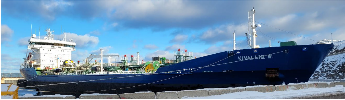
Figure 1. The Kivalliq W.

The bridge is equipped with all navigational equipment required by regulations, including a simplified voyage data recorder (S-VDR).