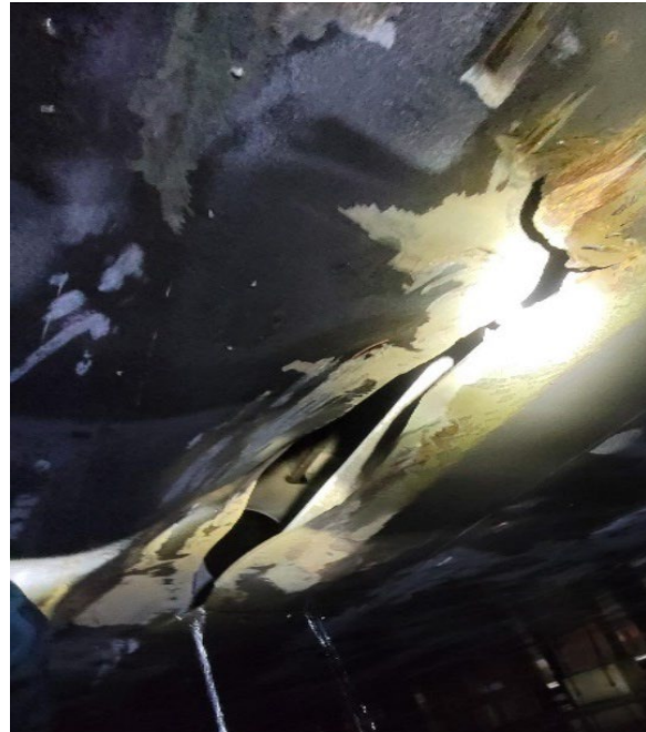
Figure 4. Damage to the vessel, viewed from inside No. 3 starboard ballast water tank