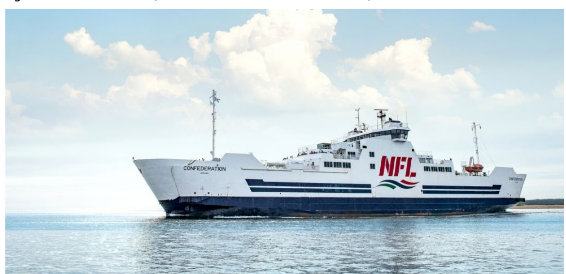
Figure 1. The Confederation

The vessel is registered to the Minister of Transport of the Government of Canada, which is also the authorized representative (AR), and operated by Northumberland Ferries Limited (NFL). The classification society Lloyd's Register is the recognized organization (RO) for the Confederation .