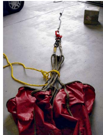
Figure 3. Bonnet with sling

In 1993, the TSB carried out an engineering analysis of helicopter sling aerodynamics and produced Engineering Report LP 51/93. At that time, in response to the engineering report and occurrence A92W0177, the Board issued recommendation A93-12, directed to Transport Canada. The recommendation highlighted the fact that, within the industry, there had been several helicopter accidents resulting from tail-rotor damage caused by contact with slings. Those accidents resulted in several fatalities, serious injuries and, in most cases, substantial aircraft damage. A large portion of the accidents involved flights with an intentionally empty, unweighted sling, even though the helicopter community recognized this to be a hazardous practice. It was recommended that Transport Canada coordinate the development and implementation of airworthiness standards and operational limitations for helicopter slinging equipment.