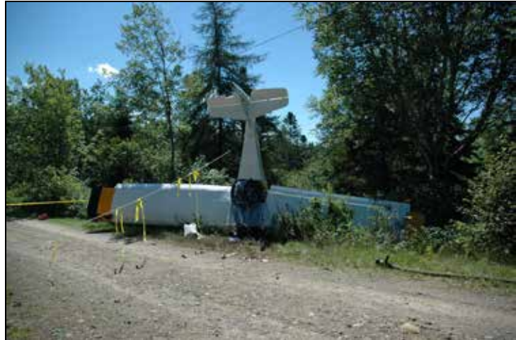
Photo 2. Aircraft impact orientation

The aircraft impact orientation (See Photo 2) and airframe damage was consistent with a steep nose-down inverted attitude typical of a low-altitude aerodynamic stall/spin event 2 . The accident aircraft was not equipped with a stall warning device, nor is one required for this category of aircraft.