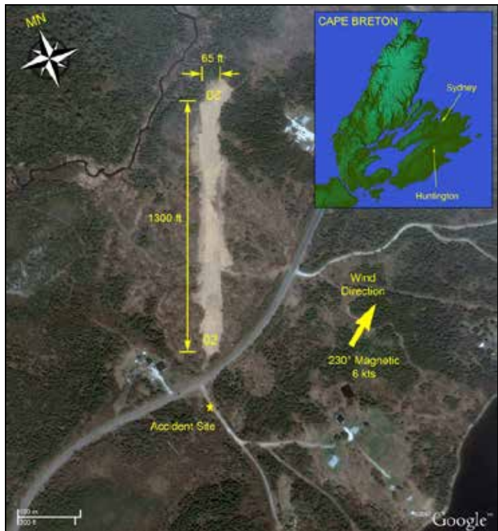
Photo 1. Aerodrome and accident site location

On the day of the flight, the pilot intended to conduct some practice in the local area. The sky was clear and the wind direction was approximately 230 degrees magnetic at less than 10 knots. The dirt airstrip runway orientation is 200 degrees/020 degrees magnetic and it is approximately 1300 feet long and 65 feet wide (See Photo 1). The pilot conducted a take-off from Runway 20 and then flew in a south-southwest direction. The time of departure was estimated as approximately 1115 1 . A local resident heard the aircraft fly over and heard the sound of impact shortly after. Once the aircraft was located and the pilot extracted from the wreckage, the 911 emergency service was called at 1139 Atlantic daylight time. The local volunteer fire department, local police, and an ambulance attended the scene. The pilot was stabilized and transported to the local hospital, eventually being airlifted to a hospital in Halifax due to the extent and severity of his injuries. Those injuries restricted his ability to recall any significant details of the accident flight.