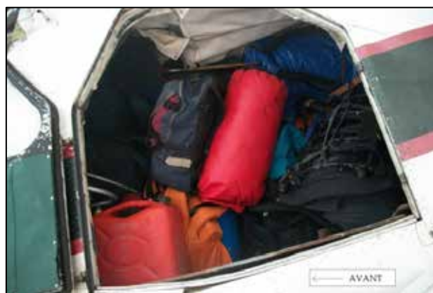
Photo 1. Baggage shifted toward the front of the aircraft

The cabin floor was not severely damaged. However, the aluminum legs of the triple seat were broken and the seat was completely separated from its attachment fittings, propelling the passengers forward. The seatbelts were anchored directly to the seats. Although baggage tie-down fittings were installed in the aircraft, the baggage was not secured to the floor, and it shifted forward (Photo 1).