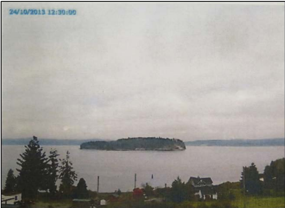
Photo 3. Image of weather in the vicinity of Port McNeill at the time of the accident

Immediately following the accident, the Royal Canadian Air Force deployed a CC-115 Buffalo and CH-149 Cormorant helicopter from Canadian Forces Base Comox to the crash site. The latter arrived over the accident site roughly 50 minutes after the accident and reported a variable cloud ceiling at 400 to 500 feet agl and calm wind conditions.