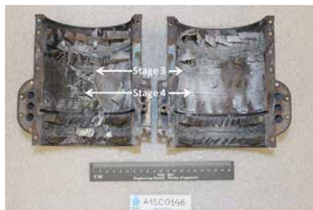
Figure 3. Compressor case halves, showing stages 3 and 4

A review of TC Civil Aviation's Service Difficulty Report database (which, in addition to Canadian data, includes data from the U.S. Federal Aviation Administration and the Australian Civil Aviation Safety Authority) revealed that, in the past 10 years, there have been 13 Allison 13 250-C20, C20B, and C20J compressor failures (fracture or excessive wear) that could not clearly be attributed to foreign object damage.