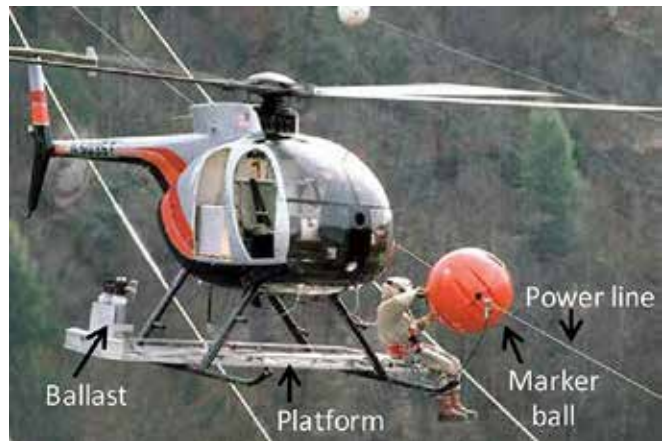
Photo 1. Marker ball installation

(Photo 1). Ballast weights are secured onto the opposite side of the external work platform to counter the weight of the platform worker and to provide lateral stability for the helicopter.