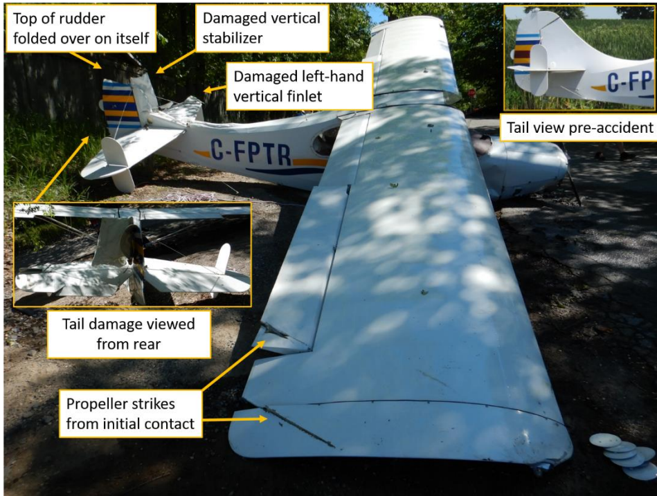
Figure 2. Damage to the Champion