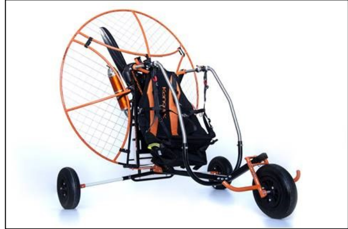
Figure 3. A representative RS Ultra Kangook MF with third party trike wheel assembly. Canopy not shown.

The training manual for paragliding 3 used for the pilot's training discussed dust devils and other adverse weather conditions but the extent to which the pilot knew about dust devils could not be determined.