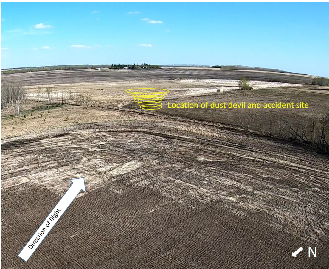
Figure 2. Still image from action video recorded on 13 May 2020, approximately 3 minutes before the accident, showing the location of the dust devil and the accident site, looking southeast

One minute before the accident, the pilot performed an approach to the take-off area in a southeasterly direction. Just before touchdown, power was applied and a go-around to the south was commenced. When it was approximately 75 feet above ground level, the aircraft flew through a dust devil (Figure 2). Without input from the pilot, the aircraft's climb rate suddenly increased, the aircraft rolled sharply to the right, and the paraglider lines wrapped around the pilot, the trike, and the turning propeller, eventually collapsing the entire canopy. At approximately 1745, control was lost and the aircraft impacted the ground, fatally injuring the pilot.