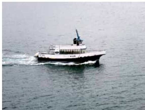
Figure 2. Summer Bay

The vessel is equipped with the following navigational equipment: