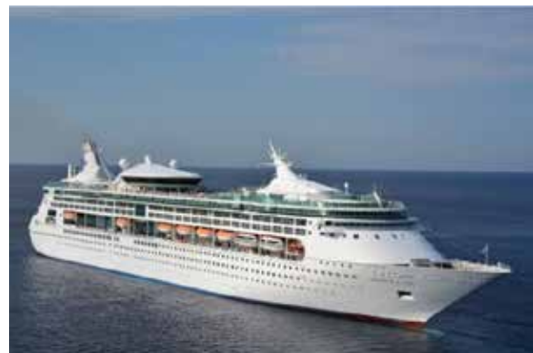
Figure 1. Grandeur of the Seas

The Grandeur of the Seas is owned and operated by Royal Caribbean International. It sails out of Baltimore, Maryland, year-round to various destinations, including cruises to the eastern