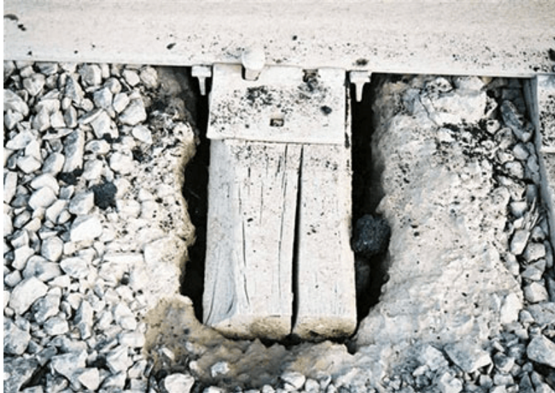
Figure 2. Contaminated ballast and pumping ties

Throughout the entire derailment zone, including the crossings, the ballast was contaminated, water saturated, and the track was pumping (see Figure 2). The surrounding land area was essentially flat farmland, some in pasturage and some with crops, with drainage ditches intersecting with the railway and road ditches. There were three culverts and one bridge between Mile 44 and the 16th Line Road crossing. The culverts were not obstructed. The ditches on both sides of the track were approximately six feet below the base of the rail and contained water.