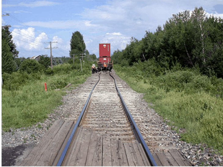
Figure 3. Track buckle looking east

Within the derailment zone, new ties had been laid out for replacement from the road crossing eastward for a distance of approximately 600 feet on the north side of the track. Prior to the arrival of the train, 25 of the ties had been changed, covering a distance from the road crossing of approximately 240 feet. Eleven of the ties were west of the last derailed car, and the remainder underneath the derailed cars in the initial zone of track destruction. Within this working zone, all the rail anchors had been removed. None of the newly placed ties were spiked, including a cluster of four consecutive ties. Both ballast shoulders had been disturbed where the old ties had been removed and the new ties installed. Some old ties were hanging or were barely seated on the disturbed ballast as the newly installed ties were \frac{3}{4} inch to 1\frac{1}{2} inches higher than the old ties left in track.