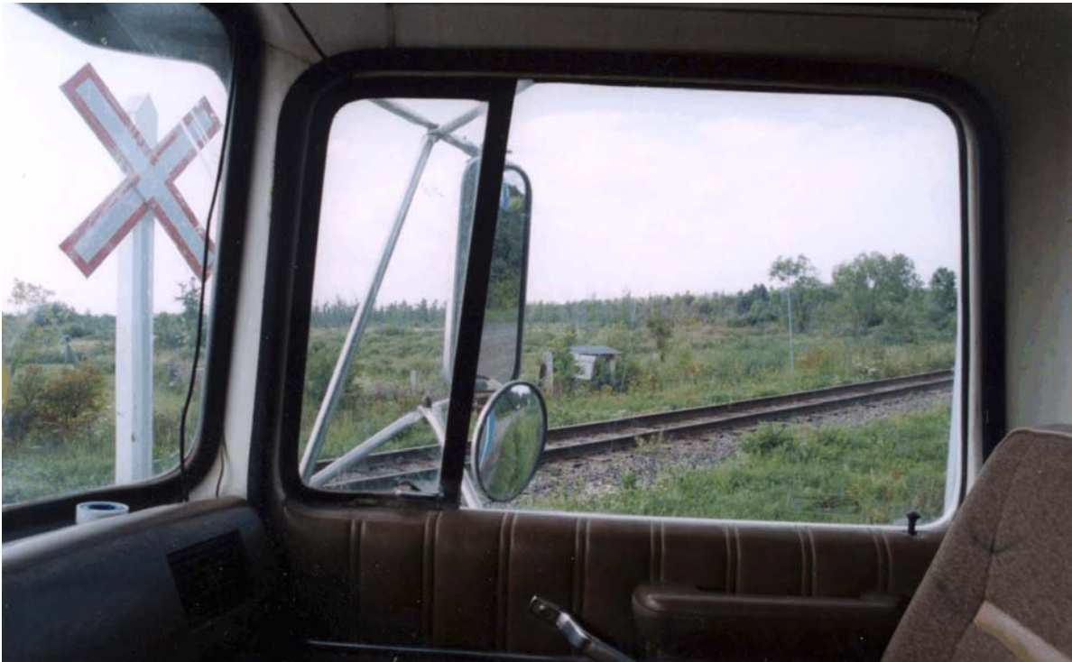
Photo 3. Driver's eastward view of tracks