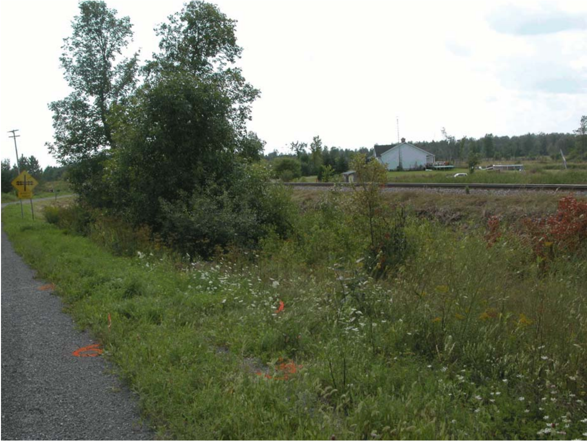
Photo 1. Driver's view to the right of the approach of Kettles Road crossing