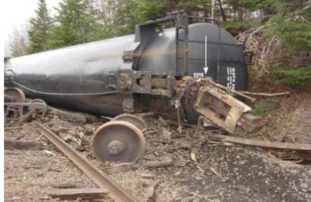
Photo 6. Broken stub sill from GATX 62822 still attached to leading end (A-end) of the sixth derailed car, LPG tank car GATX 2506

The Hopewell Subdivision extends from Truro, Mile 2.3, to Havre Boucher, Mile 116.2. It consists of a single main track. Train movements are controlled by the Occupancy Control System authorized by the Canadian Rail Operating Rules and supervised by the RTC in North Bay. The authorized zone speed between Mile 38.5 and Mile 66.0 was 35 mph for both passenger and freight trains. Between Mile 51.0 and Mile 52.6, the maximum authorized train speed was permanently restricted to 30 mph. The track was classified as Class 3 track according to the Railway Track Safety Rules (TSR) .