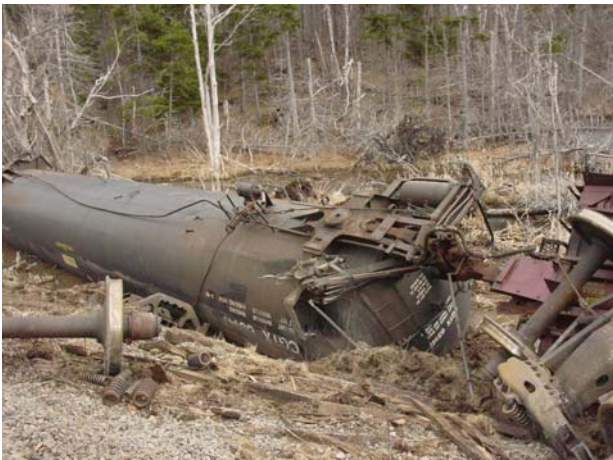
Photo 1. The first derailed LPG tank car upside down off the right-of-way

There were no injuries nor release of dangerous goods. One car was lightly damaged, eight cars were heavily damaged, and one car was destroyed. Approximately 1100 feet of track was extensively damaged or destroyed.