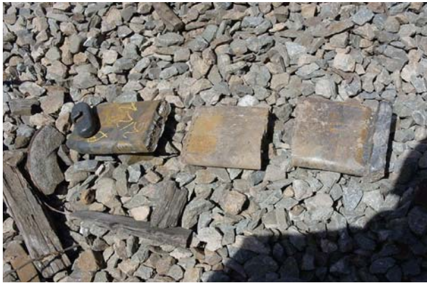
Photo 3. Broken coupler cross key on leading end (B-end) of the third derailed car, LPG tank car GATX 2122