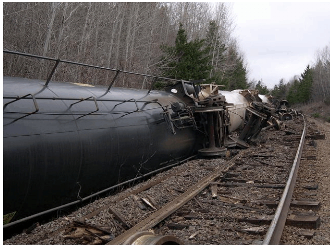
Photo 7. View of ties and rail near the initial derailment location

The TSR require a minimum of 10 crossties, in good condition and effectively distributed, for each 39-foot segment of rail. There were 26 defective ties (split, spike-killed, or broken) out of 93 ties between the entry of the spiral and the point of derailment, which is within TSR allowable limits. Several locations had two defective ties in a row; others had up to four defective ties in a cluster (Photo 7).