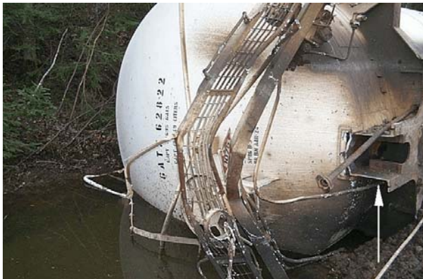
Photo 5. Arrow denotes location of broken stub sill on trailing end (B-end) of the fifth derailed car, LPG tank car GATX 62822