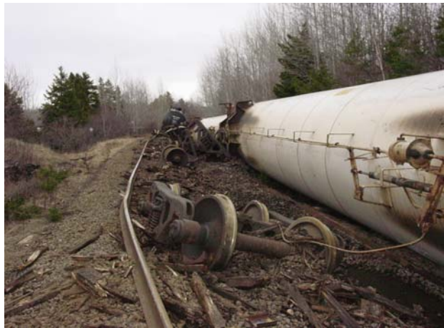
Photo 2. LPG tank cars rolled over on their side. Note extent of the track destruction