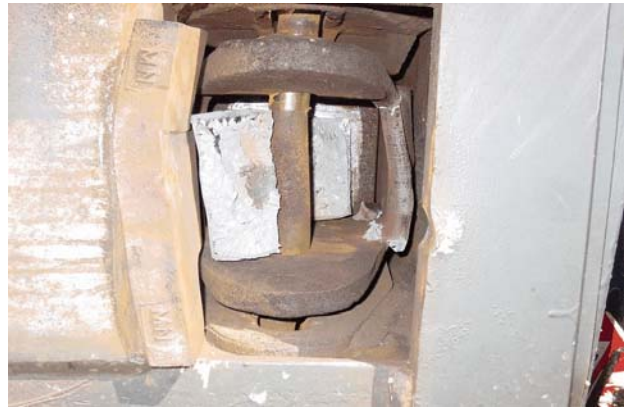
Photo 4. Broken coupler shank on leading end (B-end) of the fourth derailed car, LPG tank car GATX 9138