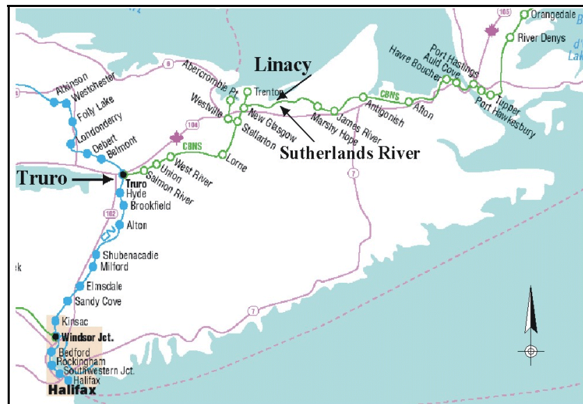
Figure 1. Schematic of geographic area

The weather was calm and clear with a temperature of 3°C.