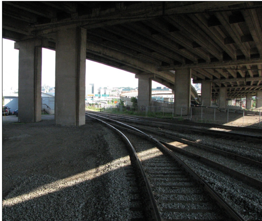
Photo 1. View to the west of the approach to turnout EL18

The TSB carried out a simulation in conditions similar to those prevailing on the day of the accident to determine the visibility distances of the yellow target on the switch stand mast. It was found that, from the helper's position, for a westbound movement on track EL02 approaching turnout EL18, the target on the switch stand mast remains hidden by a column of the Dufferin-Montmorency Highway viaduct structure for almost the entire distance (see Photo 1). It becomes visible only at a distance of 100 feet.