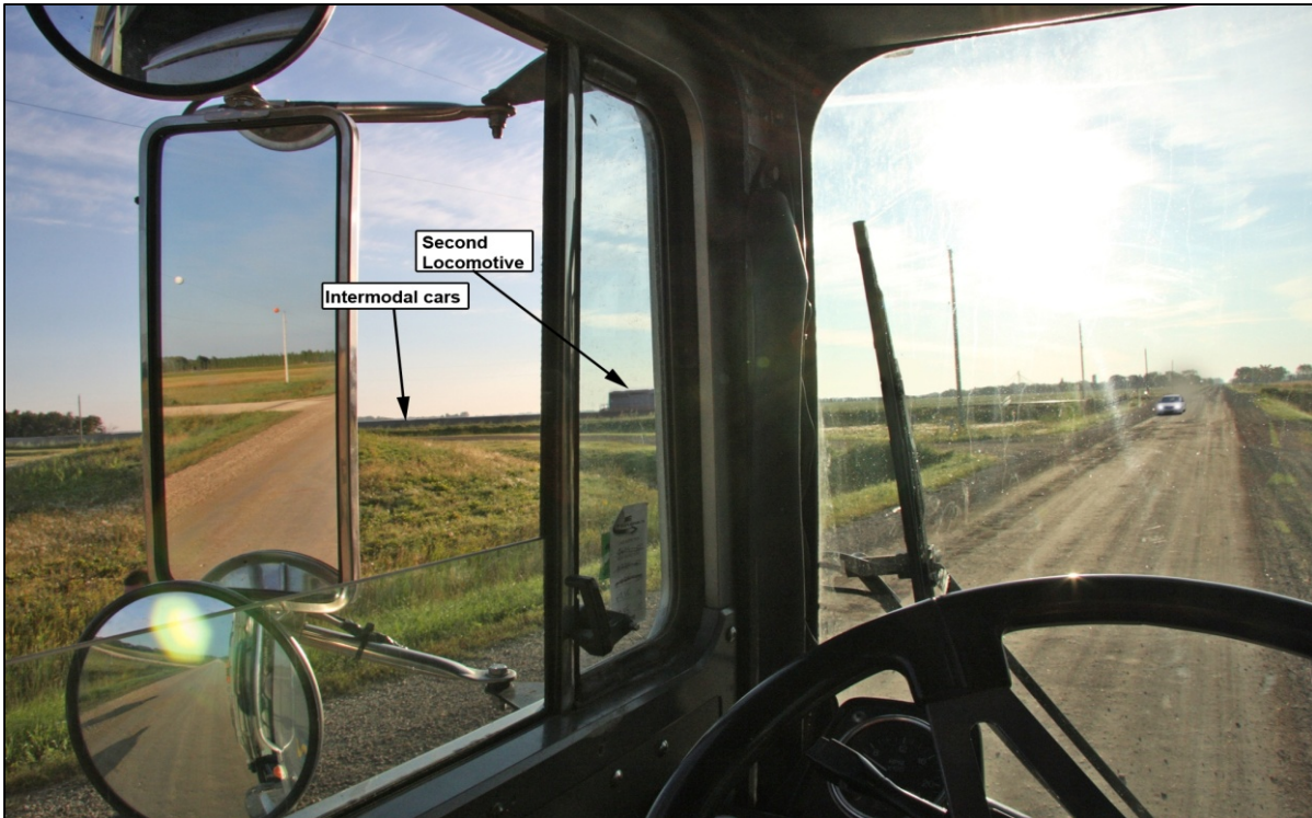
Photo 3. Simulated view approaching the crossing. The precise position of the vehicles and the environmental conditions may not be identical to those of the accident.