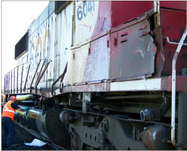
Photo 1. Locomotive SOO 6041

crossing, the driver observed the train, applied the brakes and swerved the truck to the right (south) before contacting the second locomotive. The truck was pushed into the ditch, where it overturned and came to rest southwest of the crossing.