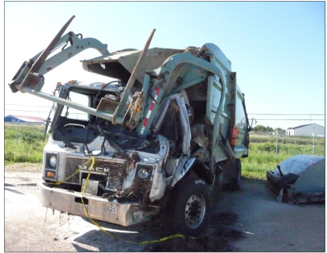
Photo 2. Mack Garbage Truck