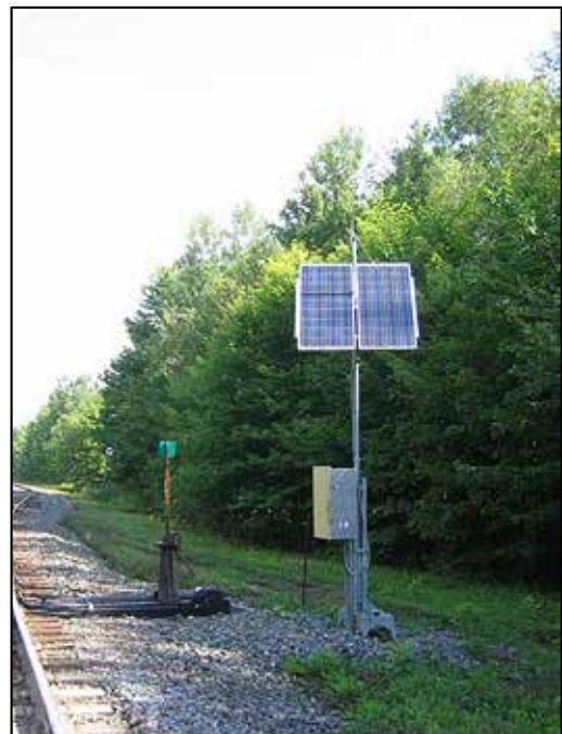
Figure 4. Switch-position detector

For road vehicle drivers or locomotive engineers, reaction time consists of detecting, identifying, deciding on, and initiating an action. Studies of road vehicle drivers provide insights on their performance when visual stimuli require a reaction, such as for braking. For road vehicle sight and stopping distance calculations with respect to road signs and public level crossings, a minimum reaction time of 2.5 seconds is recommended. 8 The complexity of a situation and