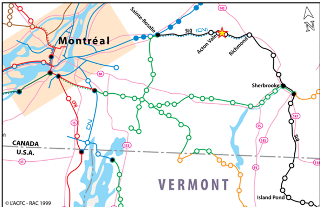
Figure 1. Map of derailment location

The train consisted of 3 locomotives, 62 loaded cars, and 17 empty cars. It weighed approximately 8200 tons and was 4700 feet long. The crew consisted of 1 locomotive engineer and 1 conductor, and they were accompanied by a trainee. The crew were familiar with the territory, met fitness and rest standards, and were fully qualified for their respective positions.