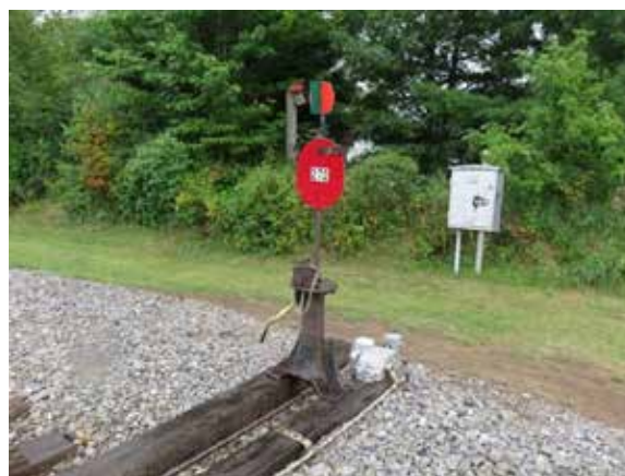
Figure 2. Red targets of switch 272 at Acton Vale

To the west of turnout 272, the main track is tangent for approximately 2500 feet, running alongside a bicycle path and a walking path.